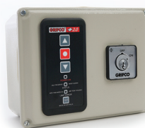
C43B – With Lockwood Key Isolator