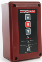
C10A-4 Standard Controller (Included with eDrive+2.0)