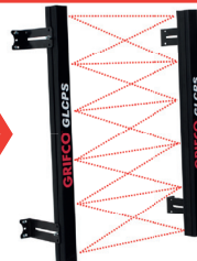
GLCPS – Light Curtain System