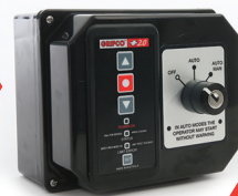
C21D-2 With Auto/Man Key Switch