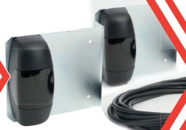
GPS772 15m Send/Recv IR Beams GPS772RK includes 2 x E945G