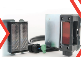
GPS15 15m Reflective IR Beams GPS15RK includes 2 x E945G