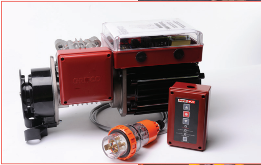
eDrive +2.0 With 3 phase pre-wired option.