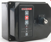
C21B – With Basic Key Isolator